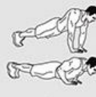
close grip push-ups