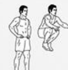
jump knee tucks