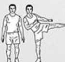
side leg raises