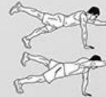
alt arm/leg plank